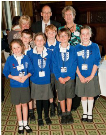
Pupils and Teachers from the Make IT Happy 2010 winning school: Jessie Youngusband Primary