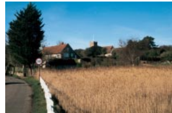
Western Yar marshes

The rivers of the Isle of Wight are small compared with those on the mainland. They may have been modified by river engineering causing a lack of natural features like pool and riffle sequences and meanders. However, in a number of areas the rivers support a diverse aquatic flora – more common species include fool's watercress, water mint, yellow flag and less common species like marsh mallow.