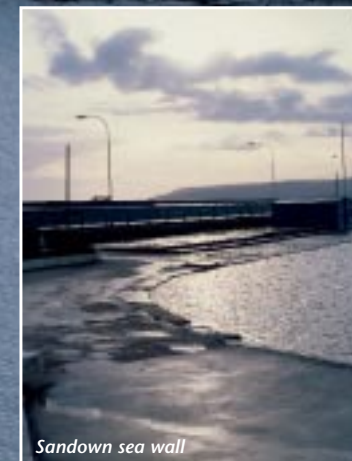
Sandown sea wall