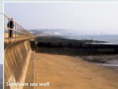
Sandown sea wall

Monktonmead Brook at Ryde has a long history of flooding dating back 100 years. In 2001 the Agency announced a £750,000 scheme to more effectively release floodwaters to the sea by extending the concrete outfall and installing two new, high capacity pumps to further relieve the pressure at very high tides