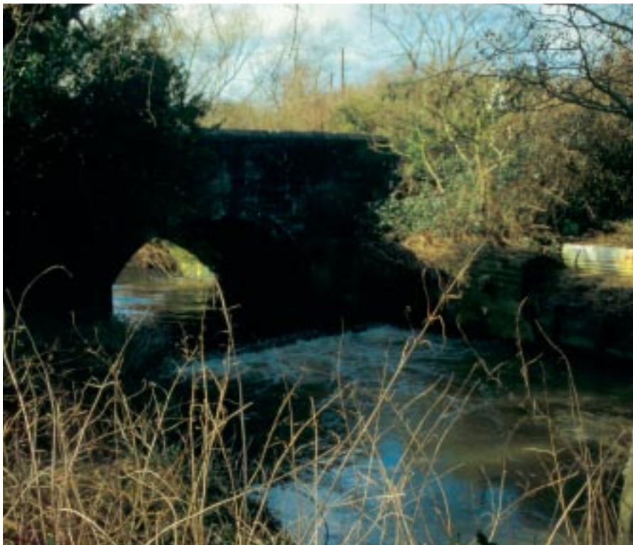
Eastern Yar - Longbridge

for agriculture. Bembridge Harbour and the Yar were extensively modified in historic times by the construction of causeways, with land reclamation and drainage above the causeway to St Helen's. The dunes of the Duver are a marked contrast to the seafront and harbour, while the embankment of the Yar upstream provides an unusual and attractive landscape of wet grazing.