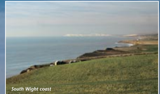
South Wight coast