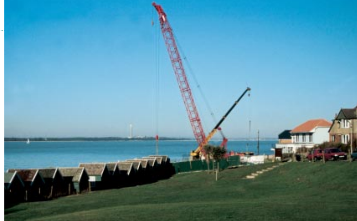
Southern Water - Seaclean Wight

concentration of chemical pollutants which they contain. In addition, samples of the creatures which inhabit the bed of the streams are taken to assess the health of the river.