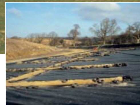
New landfill cell and drainage

There are a number of waste facilities on the Island, some of them near rivers and streams, all carefully monitored by the Agency.