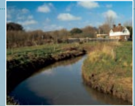
Eastern Yar at Langbridge