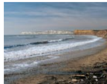
South Wight coast

Parkhurst Forest is a fine example of ancient woodland and there are several extensive areas of natural grasslands particularly on the heavy, poorly draining soils around Newtown Harbour.