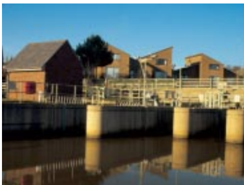
Eastern Yar sluices