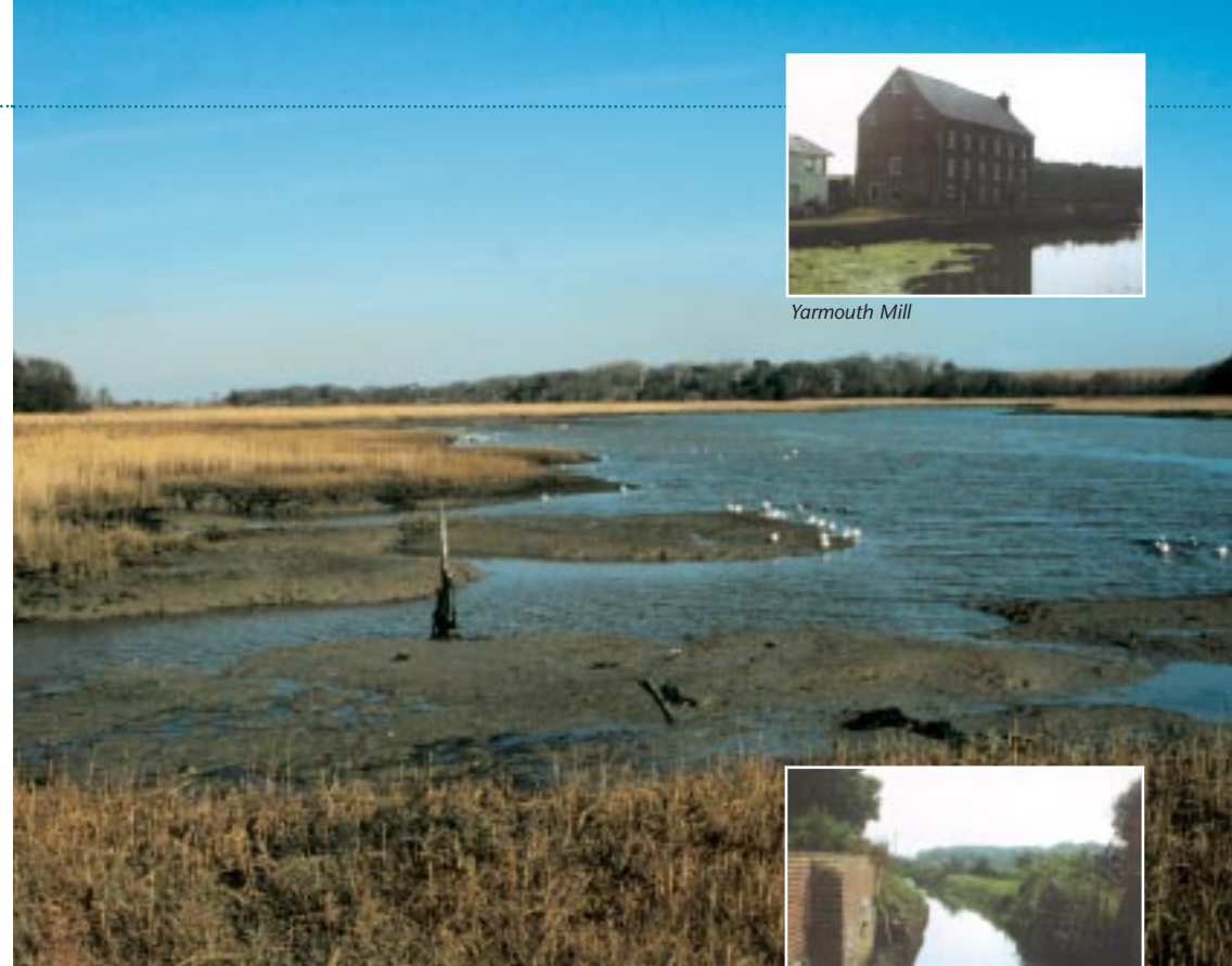
Western Yar at Freshwater Nature Reserve